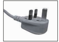
Type G (UK)