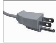
Type A (US)