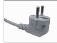
Type C (Europe)