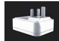
Type G (UK)