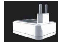
Type C (Europe)